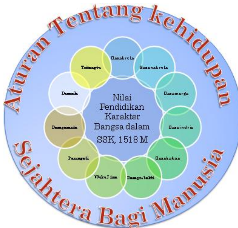
Gambar 1. The Educational Values of Local Cultural Wisdom in the Sanghyang Siksa Kandang Karesian Manuscript (1518 AD)

Pangjurung laku alus dan panyaram lampah salah (dalam SSKK, 1518) and the Sundanese view of life (Warnaen, 1986) are essentially used as references in the 18 national characters suggested by the Curriculum Center of the Ministry of National Education (2009) (Kurikulum, 2009). The essence of national character education (ethnopedagogy) in the Ancient Sundanese SSKK manuscript (1518 AD) globally can be seen in the following figure.